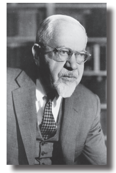
Mordecai Kaplan

It is just too bad that men who call themselves rabbis should in this day and age resort to the barbarous procedure of outlawing a man without giving him a hearing, and to the Nazi practice of burning books that displease them. God save us from such leadership and from the disgrace it is likely to bring upon Jews.<sup>69</sup>